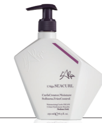
250ml / 8.5fl.oz. A 120402

Hydrating styling cream. Creates long lasting curls. Revitalizes hair, fights Frizz, restores elasticity, and boosts softness and shine. For all curl types.