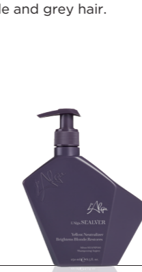
250ml / 8.5fl.oz. A 130104

Yellow tones neutralizer. Revives platinum tones, restores moisture, and enhances softness and elasticity. Fortifies both blonde and grey hair.