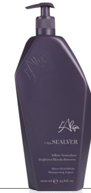
1000ml / 33.8fl.oz. A 130106