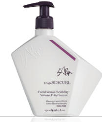
250ml / 8.5fl.oz. A 120502

Styling curl lotion with lightweight frizz-free finish. Creates long lasting extremely elastic natural curls. Adds flexibility, volume and shine. For all curl types.