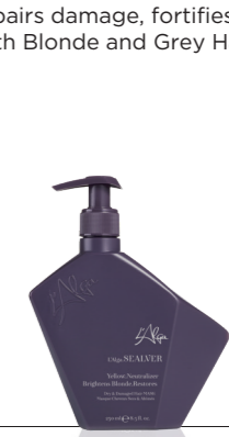
250ml / 8.5fl.oz. A 130304