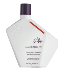
250ml / 8.5fl.oz. A 140204

Restores and improves hair's resilience and strength. Refreshes and cleanses hair & scalp. Facilitates the growth of soft, luxurious, and radiant hair. For all hair & scalp types.