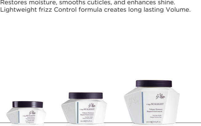
100ml / 3.4fl.oz. A 110302 250ml / 8.5fl.oz. A 110304 500ml / 16.9fl.oz. A 110305

Fine hair mask that is tailored to all fine hair types. Restores moisture, smooths cuticles, and enhances shine. Lightweight frizz Control formula creates long lasting Volume.