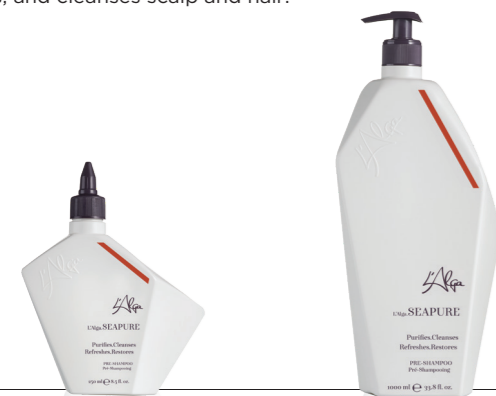
250ml / 8.5fl.oz. A 140104

Pre-treatment shampoo for all hair & scalp types. Purifies, refreshes, and cleanses scalp and hair.