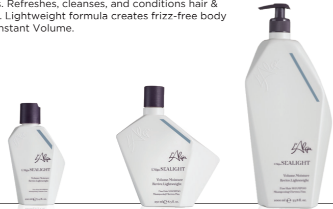
100ml / 3.4fl.oz. A 110102 250ml / 8.5fl.oz. A 110104 1000ml / 33.8fl.oz. A 110106

Fine hair shampoo that is tailored to all fine hair types. Refreshes, cleanses, and conditions hair & scalp. Lightweight formula creates frizz-free body and instant Volume.