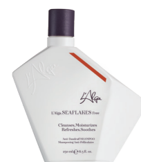
250ml / 8.5fl.oz. A 140304

Anti-dandruff shampoo treats & removes all skin flakes types. Refreshes and thoroughly cleanses dandruff from the scalp while soothing dry, itchy skin.