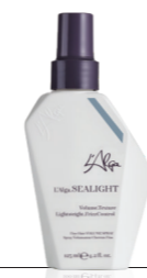
125ml / 4.2fl.oz. A 110502

Long-lasting volume creator for fine hair with lightweight frizz-free finish. Improves thickness and shine.