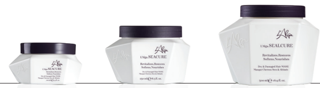
100ml / 3.4fl.oz. A 100302 250ml / 8.5fl.oz. A 100304 500ml / 16.9fl.oz. A 100305

This restorative mask balances the scalp, deeply nourishes, and strengthens the shafts from the inside out. By stimulating scalp circulation and rejuvenating hair follicles, the SeaCure remedy mask Increases hair softness, shine, and volume and restores over-worked hair to its prime condition.