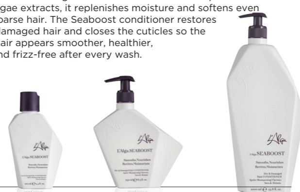
100ml / 3.4fl.oz. A 100202 250ml / 8.5fl.oz. A 100204 1000ml / 33.8fl.oz. A 100206

This hydrating conditioner balances the scalp and reinforces the inner strength of each strand. With a unique blend of algae extracts, it replenishes moisture and softens even coarse hair. The Seaboost conditioner restores damaged hair and closes the cuticles so the hair appears smoother, healthier, and frizz-free after every wash.