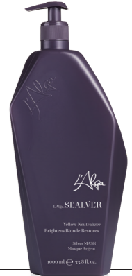
1000ml / 33.8fl.oz. A 130106