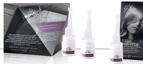
8x12ml/0.40fl.oz. A100608 12ml / 0.40fl.oz. A100601

The highly concentrated Bolster lotion repairs and conditions aging, damaged, over-processed, and dry hair. This revitalizing scalp treatment provides intensive nourishment to each hair shaft from within. The AlgaNord 5™ complex, Biotin, and Magnesium combine to create a heat-activated thermal shield which forms an optimal environment for hair growth and protection from heat-damage - for hair that looks and feels healthier, softer, thicker and denser.