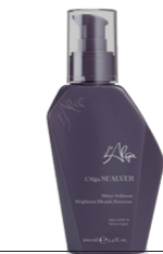
100ml / 3.4fl.oz. A 130402

Styling & finishing serum. Adds brilliant shine and softness. Maintains blonde and grey hair free of yellow tones.