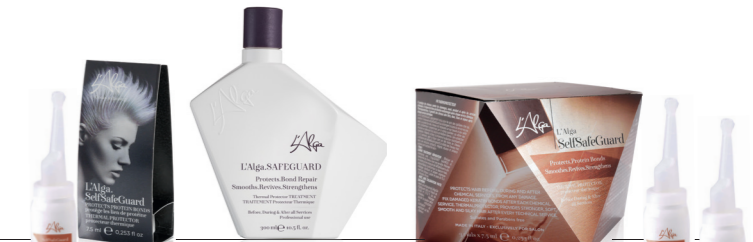
7,5ml/0.25 fl.oz. A 100701 300ml / 10.5fl.oz. A 200101 3 x 7,5ml/0.24 fl.oz. A 100703

Long term effects that build healthier and stronger hair. Allows multiple procedures in one-salon-visit without typical damages such as extreme dryness or hair breakage. Recommended to use on hair that is over-processed, weak, and dry. The end result is strong, shiny, and manageable hair.