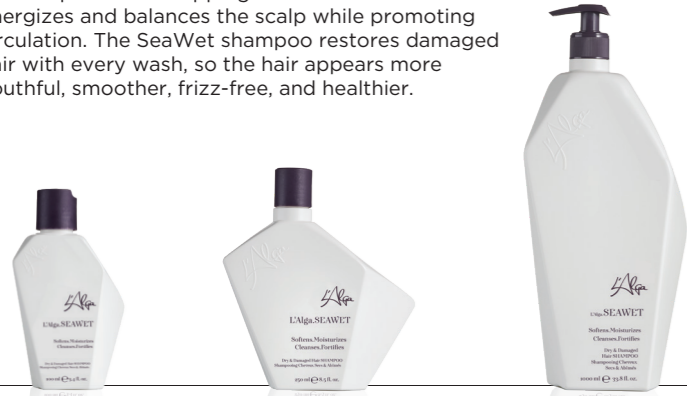
100ml / 3.4fl.oz. A 100102 250ml / 8.5fl.oz. A 100104 1000ml / 33.8fl.oz. A 100106

This revitalizing shampoo gently cleanses the hair and scalp without stripping natural sebum. It energizes and balances the scalp while promoting circulation. The SeaWet shampoo restores damaged hair with every wash, so the hair appears more youthful, smoother, frizz-free, and healthier.