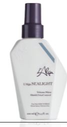
100ml / 3.4fl.oz. A 110402

A versatile serum that adds volume to fine hair as well as providing heat styling protection when used as finishing spray for all hair types. Lightweight frizz control formula improves flexibility, softness, and shine.